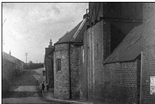
Broomhill Paper Mill, Post 1900

Please visit our website at www.dennyoralhistories.co.uk to learn more about our oral history project. If you have more information, memorabilia or photographs to add to our project, please contact us. We see our history as a living thing and are always happy to expand our knowledge.