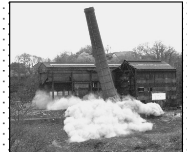
(R) Demolition of chimney at site of former Carrongrove Paper Mill November 2009

"When an elder dies, it is as if an entire library has burned to the ground." ~ African Saying